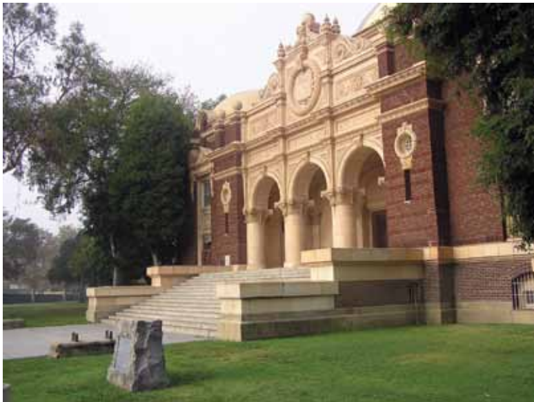
Fig. 1: Original building constructed in 1913

T he original T-shaped portion of the Los Angeles County Museum of Natural History that fronts the Rose Garden was designed in 1910 by the prominent Los Angeles, CA, architectural firm of Hudson & Munsell. Construction of the