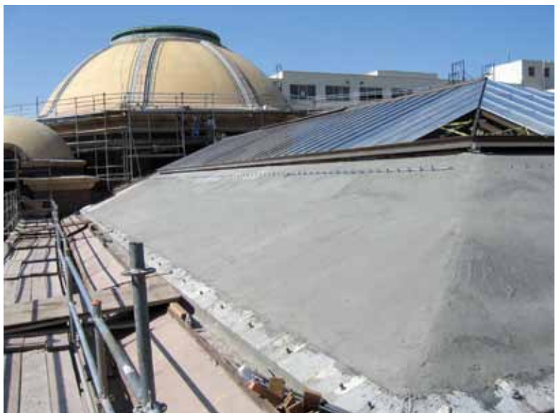
Fig. 5: Roof deck after it has been prepared for CFRP installation