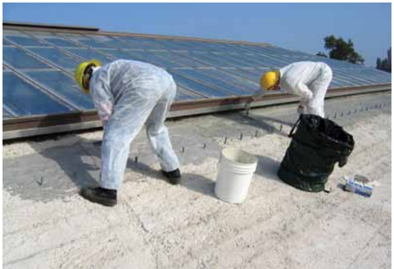
Fig. 4: Smoothing the rough concrete deck