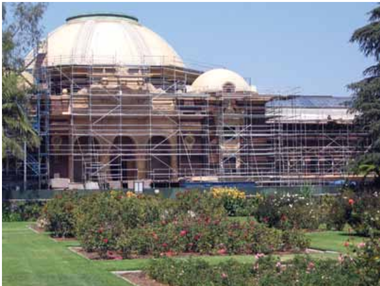
Fig. 2: Building with scaffolding during seismic upgrade in summer 2007

Spanish Renaissance-style building began on December 17, 1910, and the total cost for the building was $225,000. The central portion of the cross-shaped building is 75 x 75 ft (23 x 23 m) with a dome that is 80 ft (24.4 m) high. The east and west wings are each 54 x 110 ft (16.5 x 33.6 m) and the north wing is 54 x 125 ft (16.5 x 38.1 m). The framing consisted of steel frame and unreinforced brick walls.