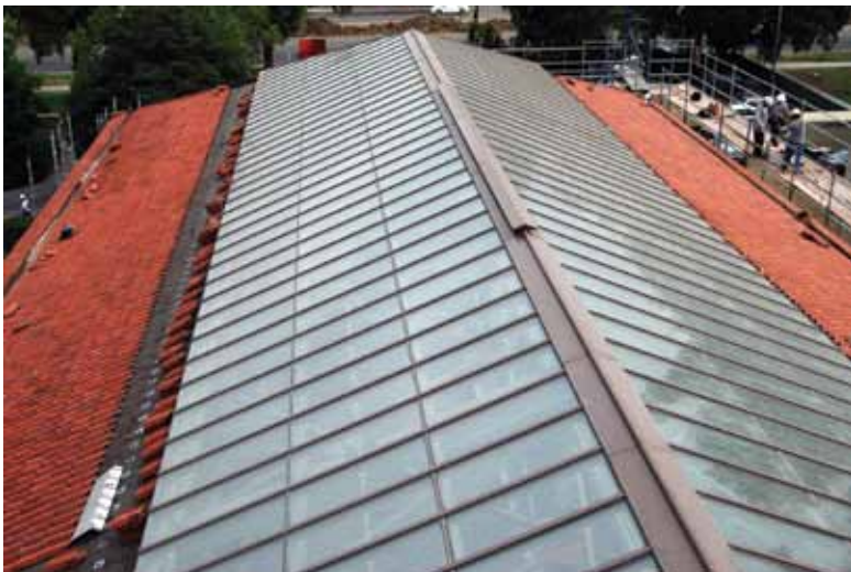
Fig. 8: Restored shingles replaced on the roof with new skylights