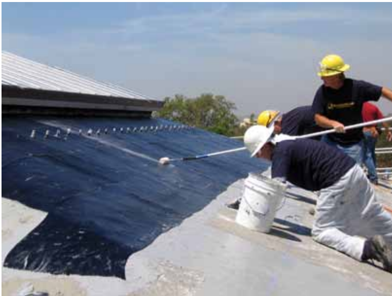
Fig. 6: Installation of CFRP strips over protected steel bolts