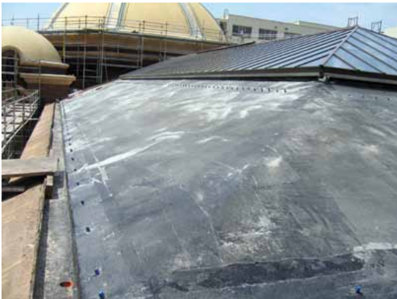
Fig. 7: Retrofitted slab after broadcasting of sand on top of CFRP