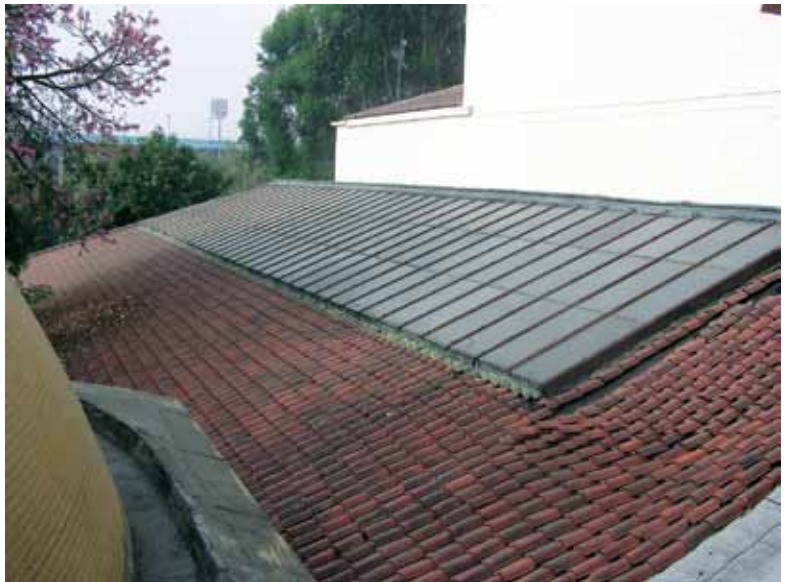
Fig. 3: View of roof and shingles before seismic upgrade