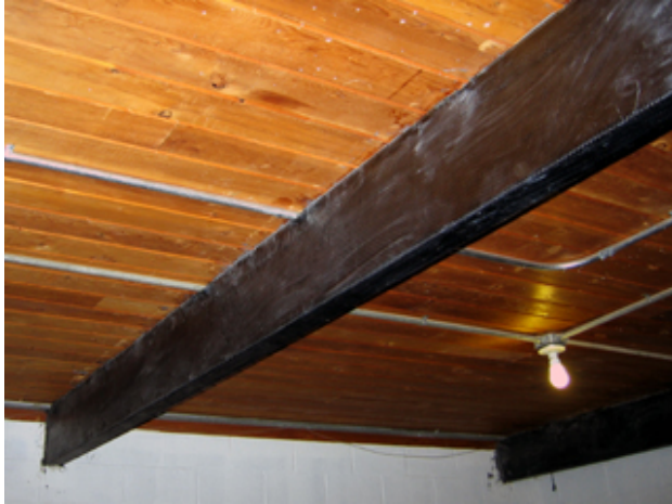
A retrofitted beam in the Coolidge Roundhouse gym is fully encased with a carbon-fiber covering.