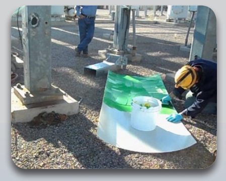
Cut a piece of PileMedic<sup>™</sup>, apply epoxy & wrap ...