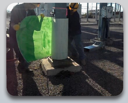
... around the column to create a 36-inch high shell