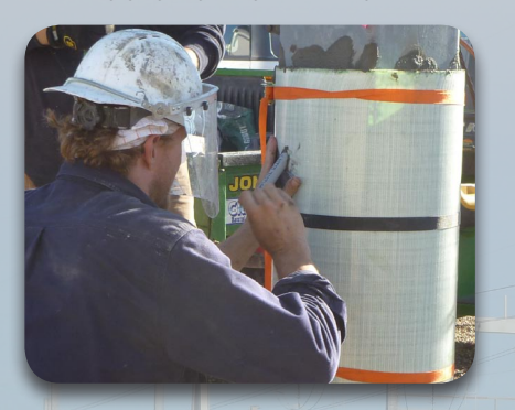
Insert drain pipe (if required)