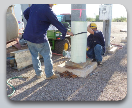
Use ratchet straps to support shell temporarily