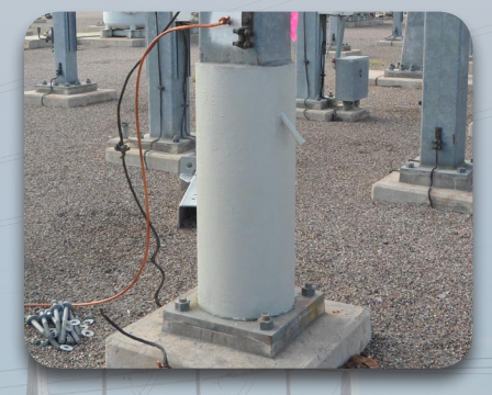
Remove ratchet straps & paint jacket (if desired)